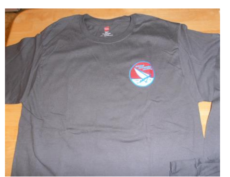
front of shirt

WSSA long sleeve t-shirts, $25.00 each plus shipping. Choice of three colors – charcoal, medium blue, and forest green. A colored WSSA logo is on the left side of chest, a stern steerer in a tall hike (thanks to Jeff Seeboth for the pose) is on the back. Send t-shirt orders to WSSA Secretary/Treasurer.