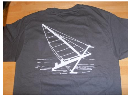
back of shirt